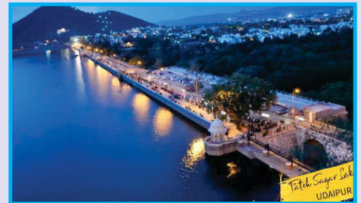
Fateh Sagar Lake