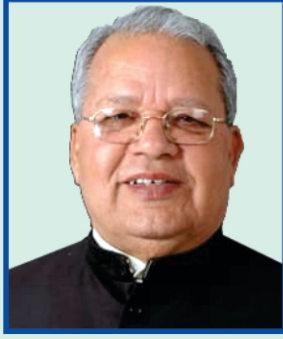
Chief Patron Shri KALRAJ MISHRAJI Hon'ble Governor Rajasthan